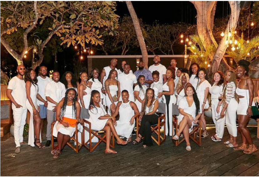
Gravel World Travelers in Bali , April 2019