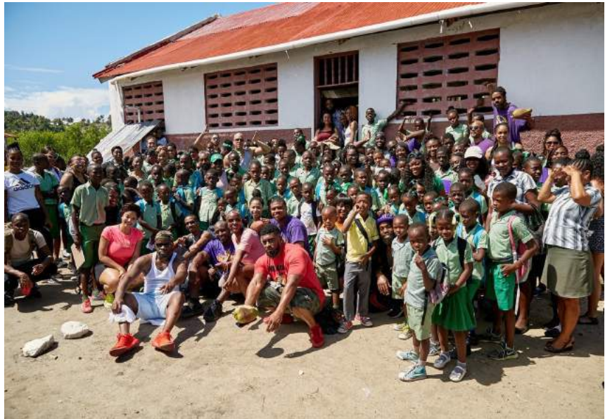
Gravel World in Haiti 2017 doing service work at the orphanage

TRIP PLANNING: Experience any of our curated trips on your own dates and with your travel crew. Or let us curate a new trip to anywhere in the world. Our trip planning services allow us to customize a trip for you based on your unique requirements. We plan everything from lodging accommodations, tours, dining, nightlife, and unique experiences based on your budget. Email us at info@gravelwrld.com to get started.